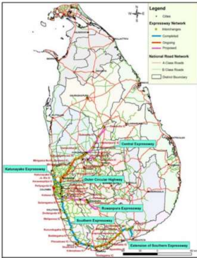
Fig. 1 Expressway Network in Sri Lanka